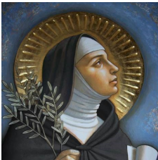
St. Claire, Abbess of Assisi, 1253 AD. Aug 11th.

The discipline of fasting seeks to order our life by grace with our cooperation through discipline and prayer.